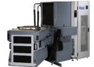
Ultra Flex RF